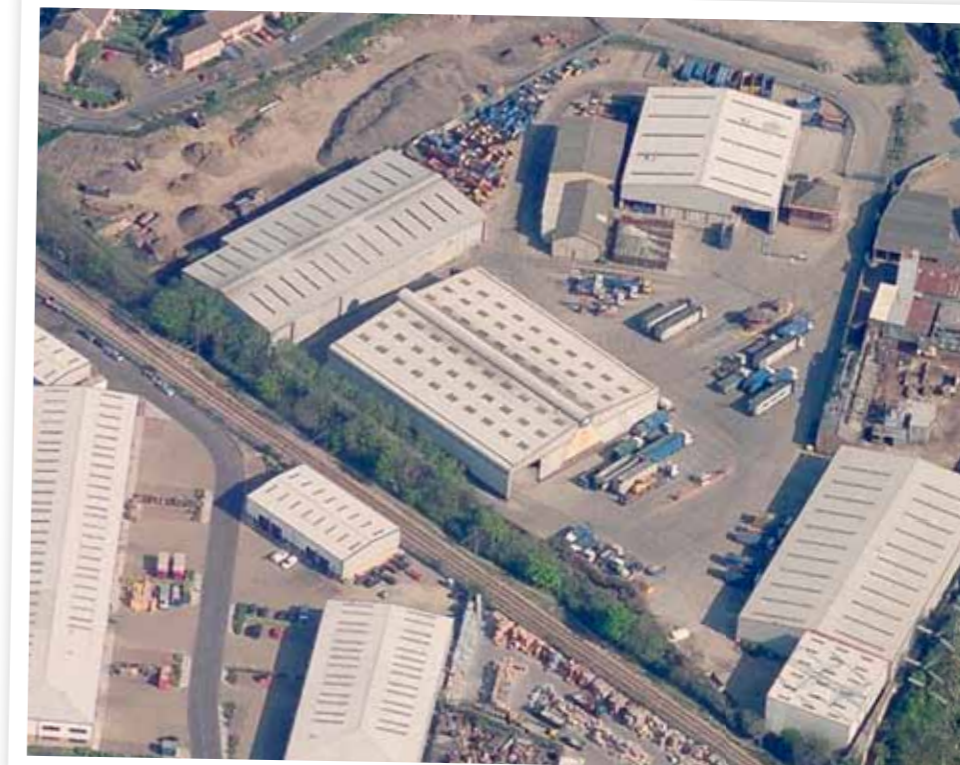
Aerial view of the current facility