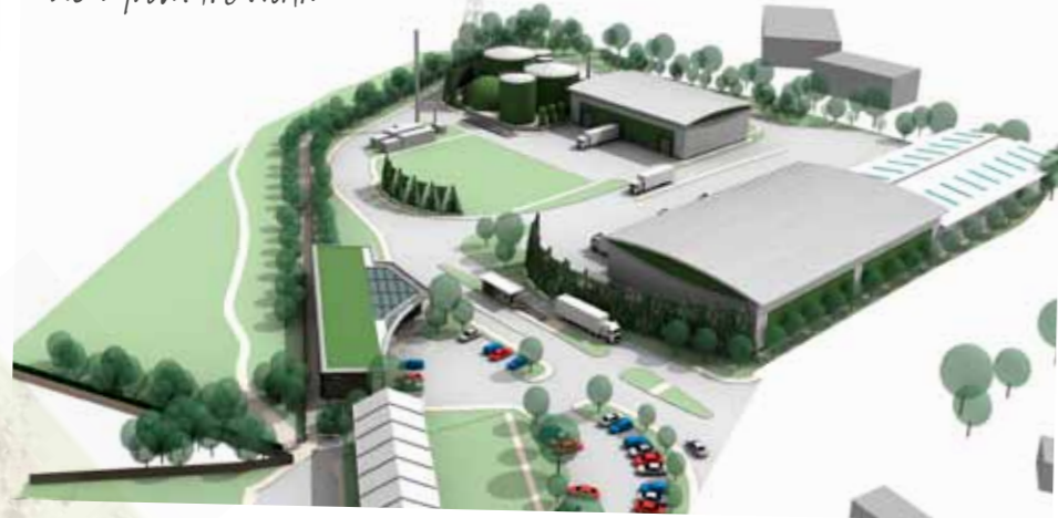
Proposed facility illustration, view from the north