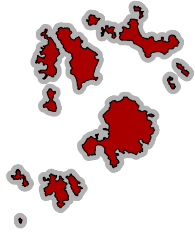
Inset: 13. Isles of Scilly